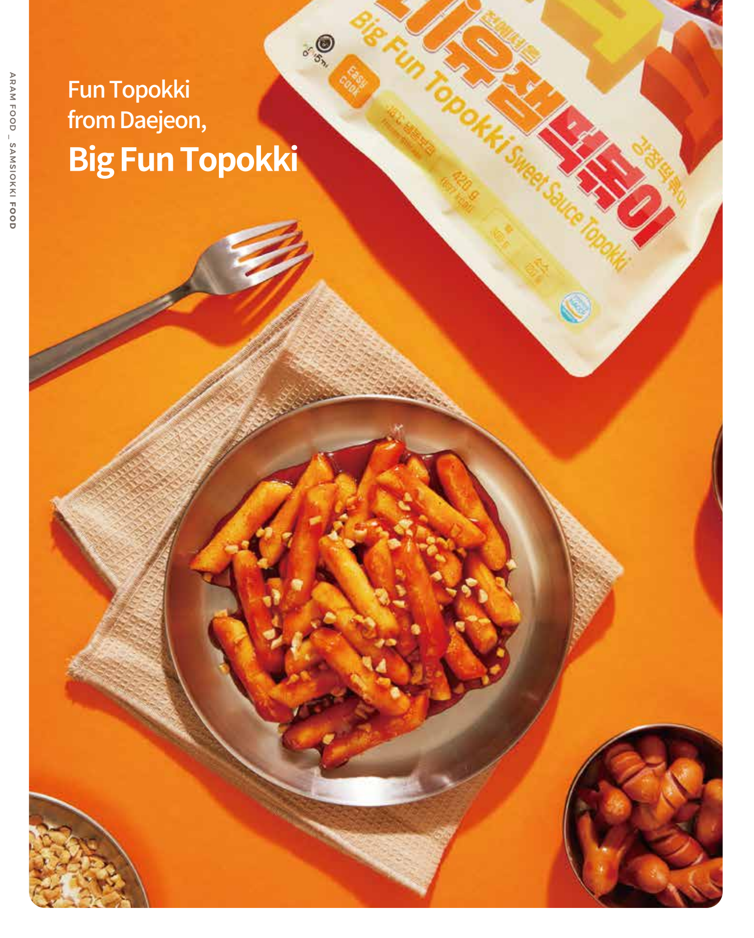
HMR frozen food that can be simply made in just under 5 minutes