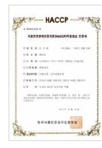
HACCP (mixed beverage)