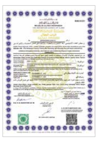
MUI HALAL (rice cake, beverage)