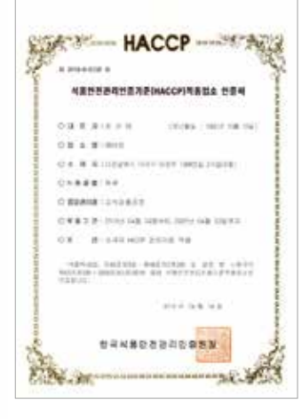
HACCP (rice cake)